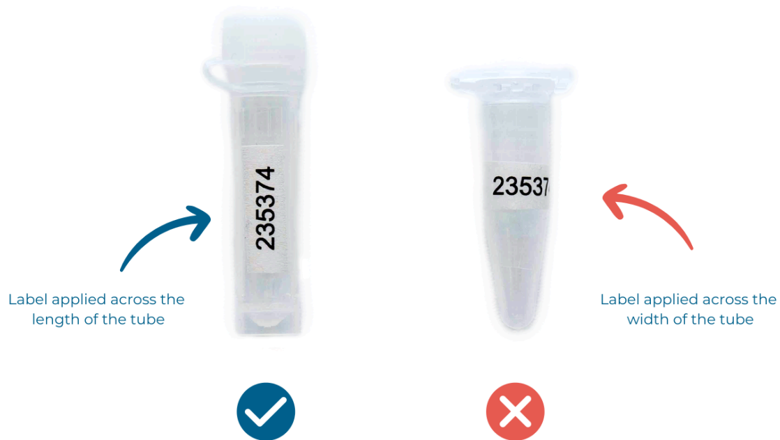
Figure 3. How to correctly apply labels to your tubes. (Note: if you print your own labels only the sample ID number is required, not the barcode!)