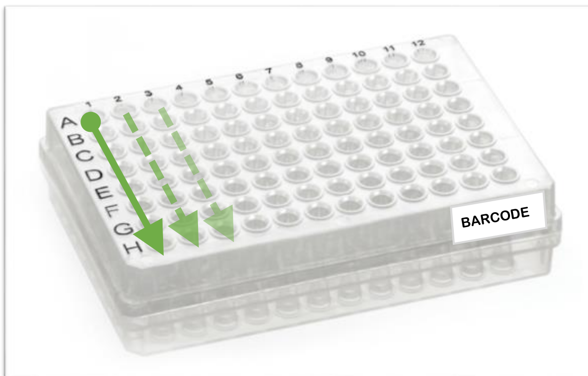
PICTURE 3. HOW TO LOAD SAMPLES IN A 96-WELL PCR PLATE. Load by columns starting in well A1.